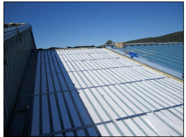
This Franklin Township roof used roof huggers attached through an existing standing seam roof to install a new standing seam roof, eliminating costly tear-off while making it possible to upgrade the facility's energy efficiency with added insulation.

exceeding its strength on a pound-to-pound basis. That means at least some of the initial cost of metal is immediately paid back during new construction since metal roofs require fewer support materials. When it comes to reroofing, the lighter weight of metal makes retrofitting an option in many scenarios, making it possible to avoid costly tear-offs of roofs that have already met the building code maximums. This too can result in significant cost savings, even more so where the existing system includes asbestos or some other hazard whose removal can add prohibitive costs.